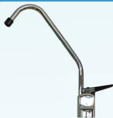
Drinking water faucet included

SYSTEM INCLUDES CARTRIDGE, FAUCET & INLET FITTINGS