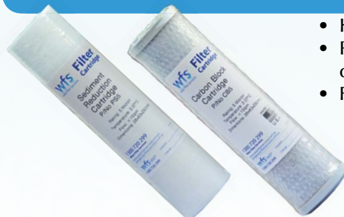
Sediment cartridge in housing 1

SYSTEM INCLUDES CARTRIDGES & ACCESSORIES